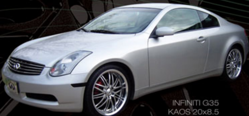
INFINITI G35 KAOS 20x8.5