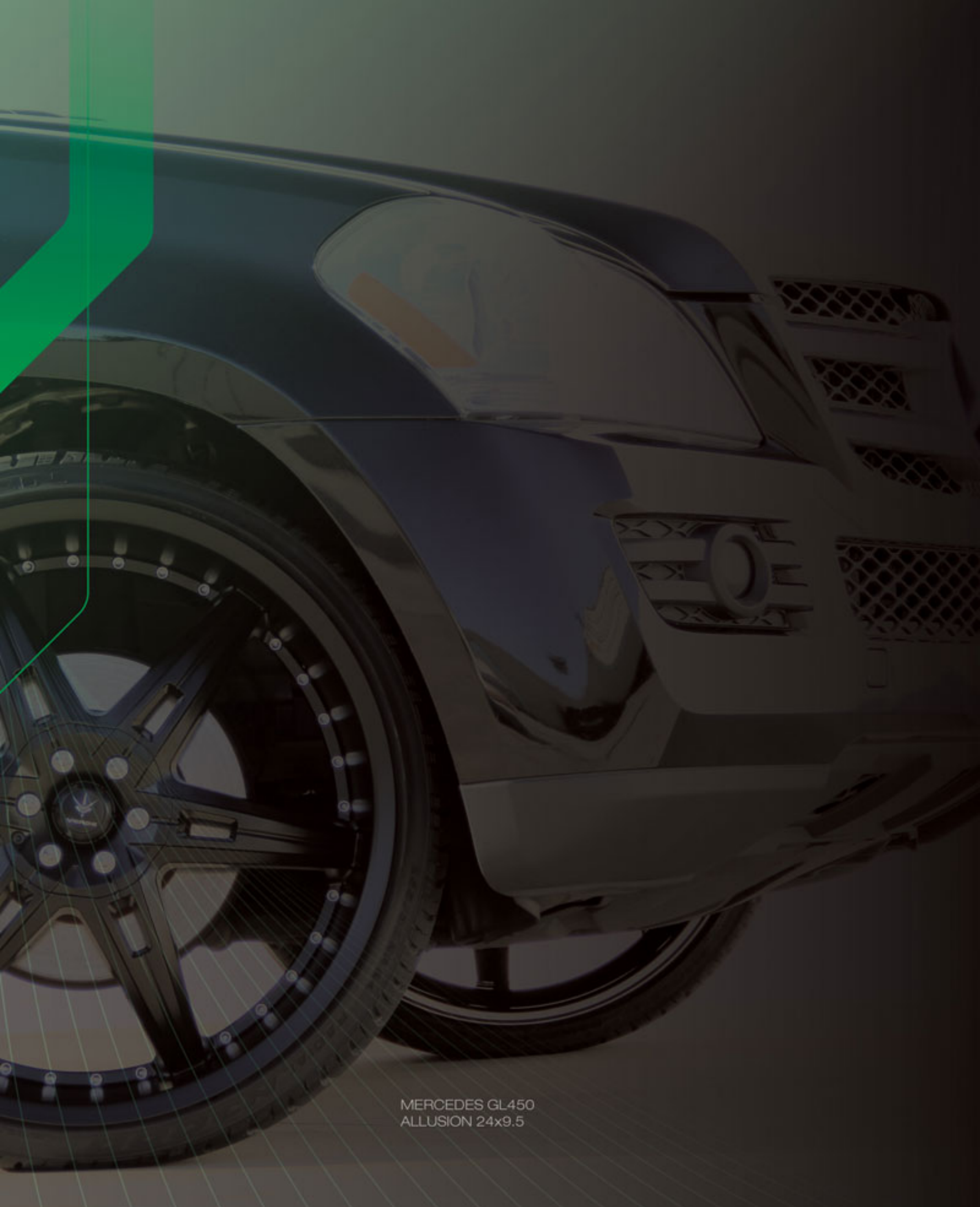
MERCEDES GL450 ALLUSION 24x9.5