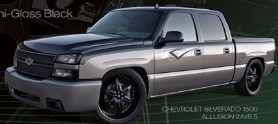
CHEVROLET SILVERADO 1500 ALLUSION 24x9.5