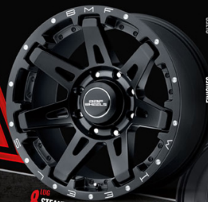
8 LUG STEALTH SATIN BLACK & CNC