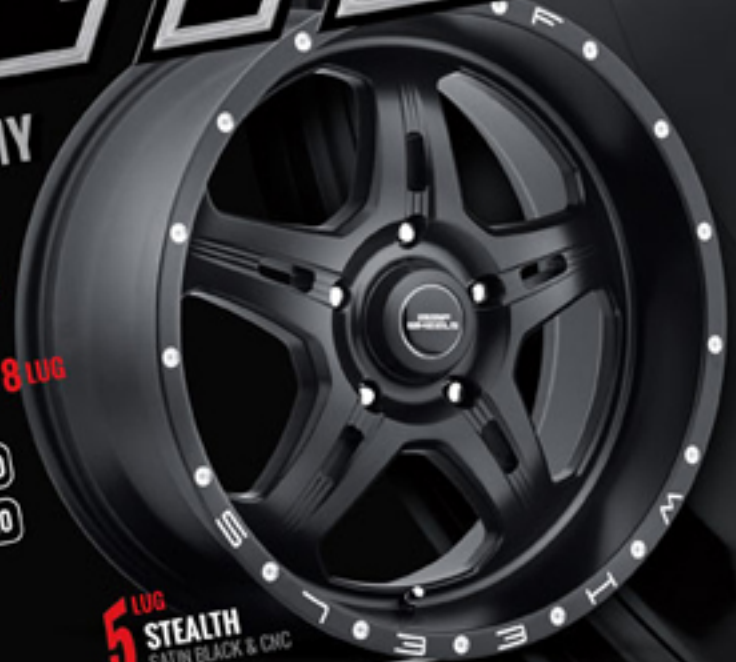
5 LUG STEALTH SATIN BLACK & CNC