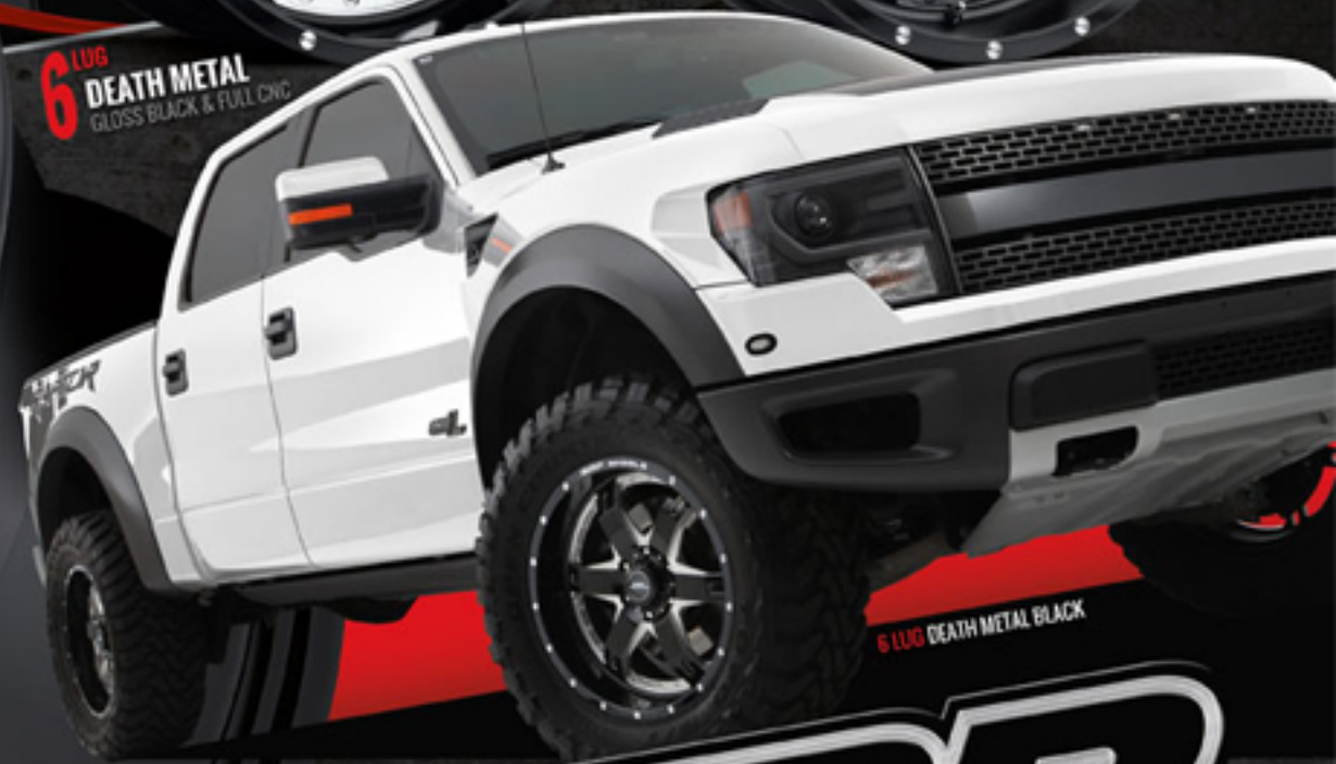
6 LUG DEATH METAL BLACK