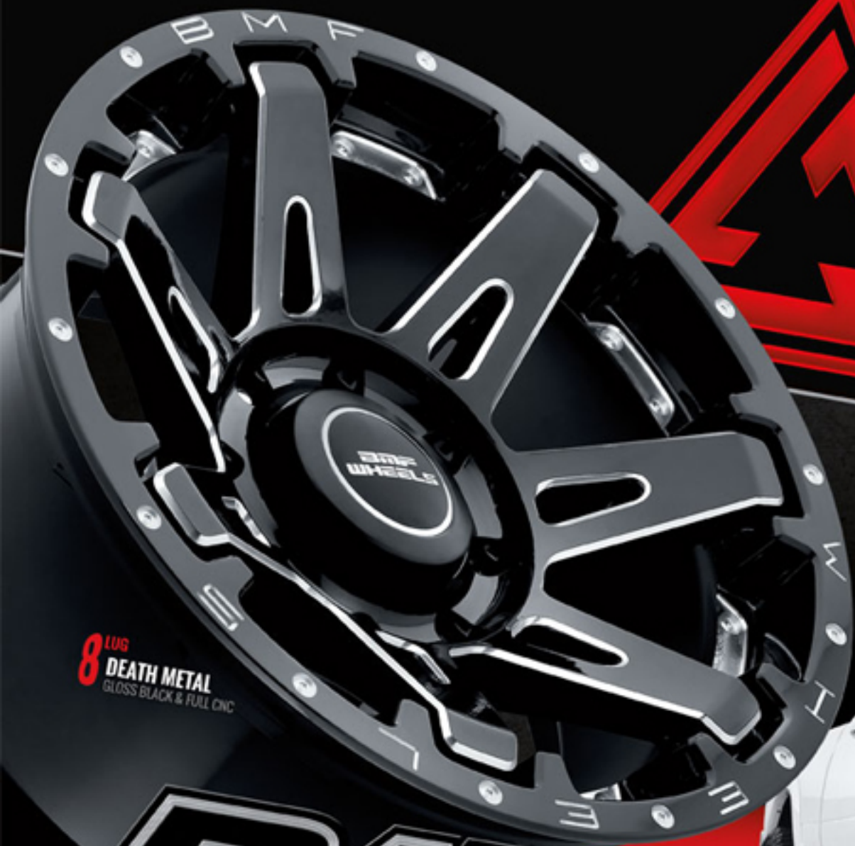
8 LUG DEATH METAL GLOSS BLACK & FULL CNC