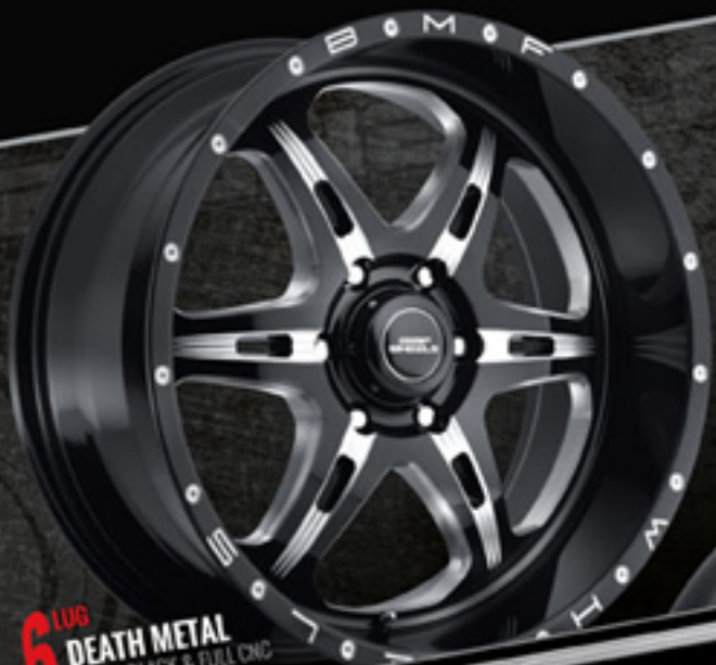
6 LUG DEATH METAL GLOSS BLACK & FULL CNC