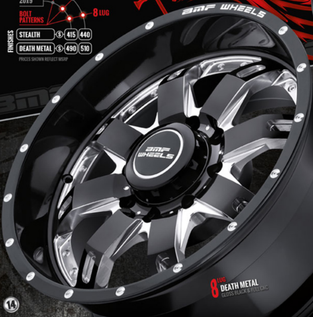
8 LUG DEATH METAL GLOSS BLACK & FULL CNC