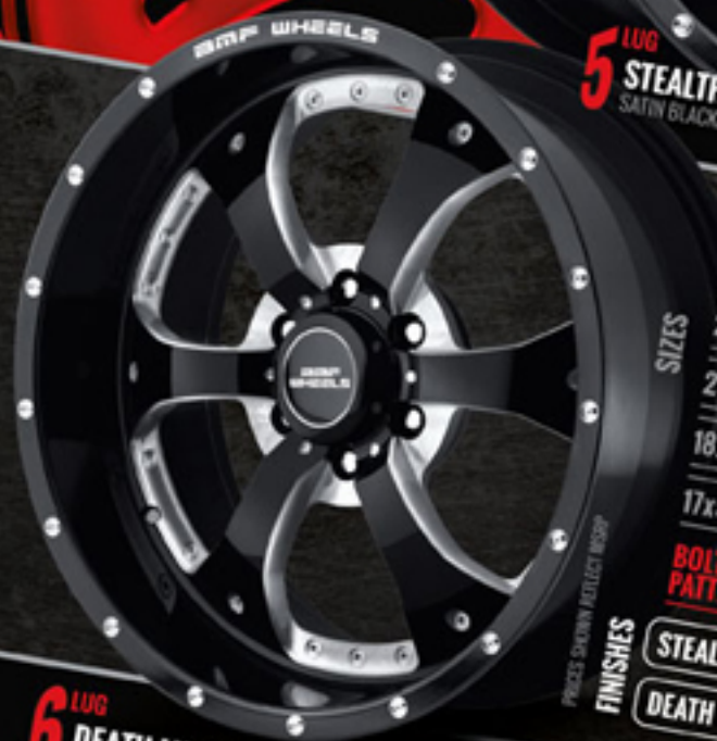
6 LUG DEATH METAL GLOSS BLACK & FULL CNC