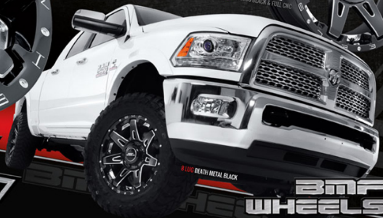
8 LUG DEATH METAL BLACK