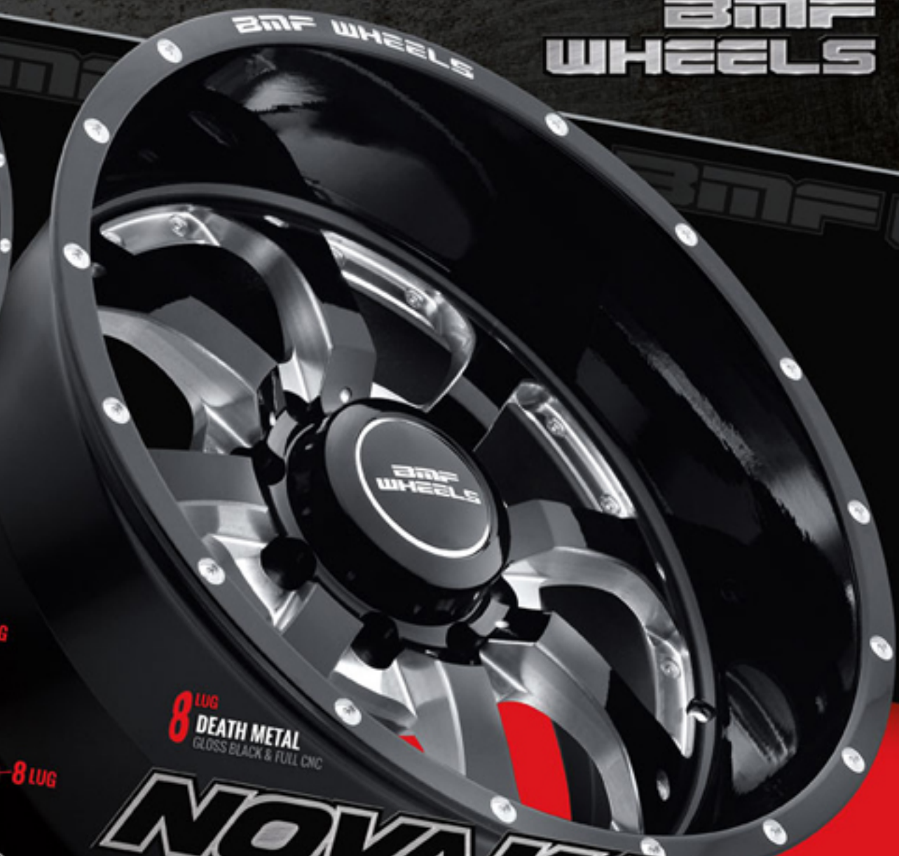
8 LUG DEATH METAL GLOSS BLACK & FULL CNC