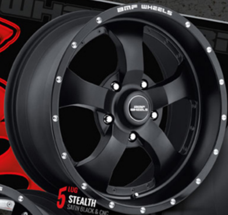
5 LUG STEALTH SATIN BLACK & CNC