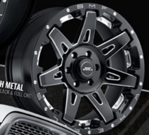
6 LUG DEATH METAL GLOSS BLACK & FULL CNC