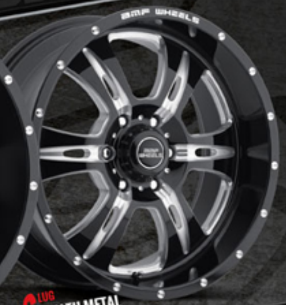
6 LUG DEATH METAL GLOSS BLACK & FULL CNC