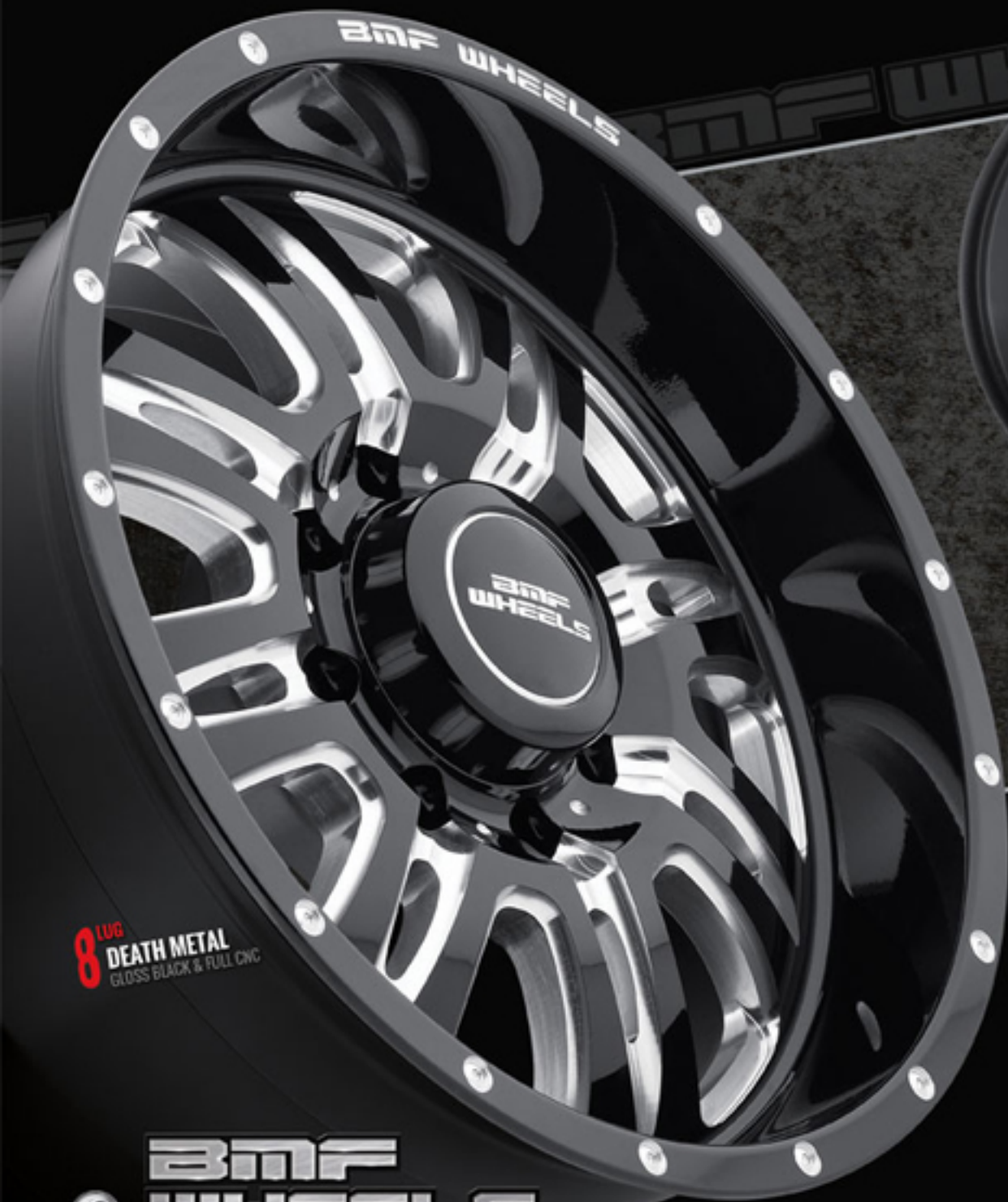
8 LUG DEATH METAL GLOSS BLACK & FULL CNC