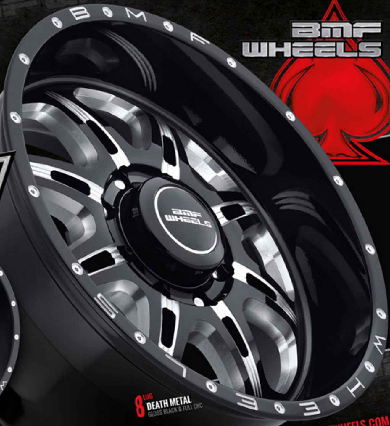
8 LUG DEATH METAL GLOSS BLACK & FULL CNC