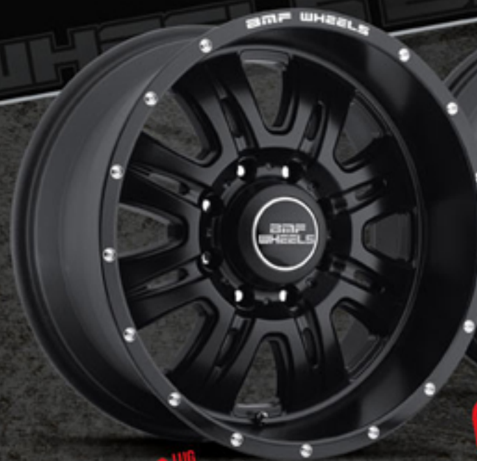
8 LUG STEALTH SATIN BLACK & CNC