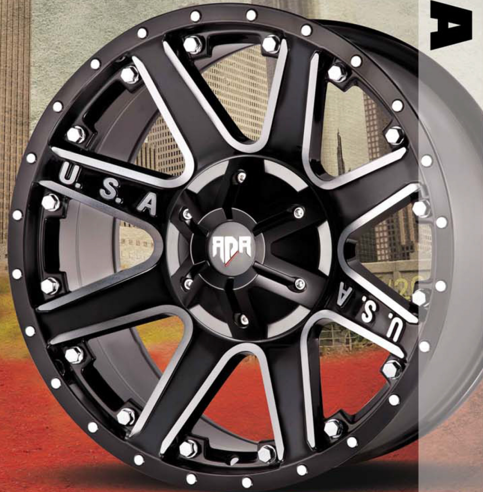
USA RD-04 17" 18" 20" 22" Finishes: ALL Blk, Blk/Machined & Chrome