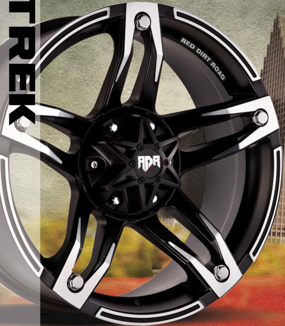
TREK RD-03 17" 18" 20" Finishes: All Blk, Blk/ Machined & Chrome