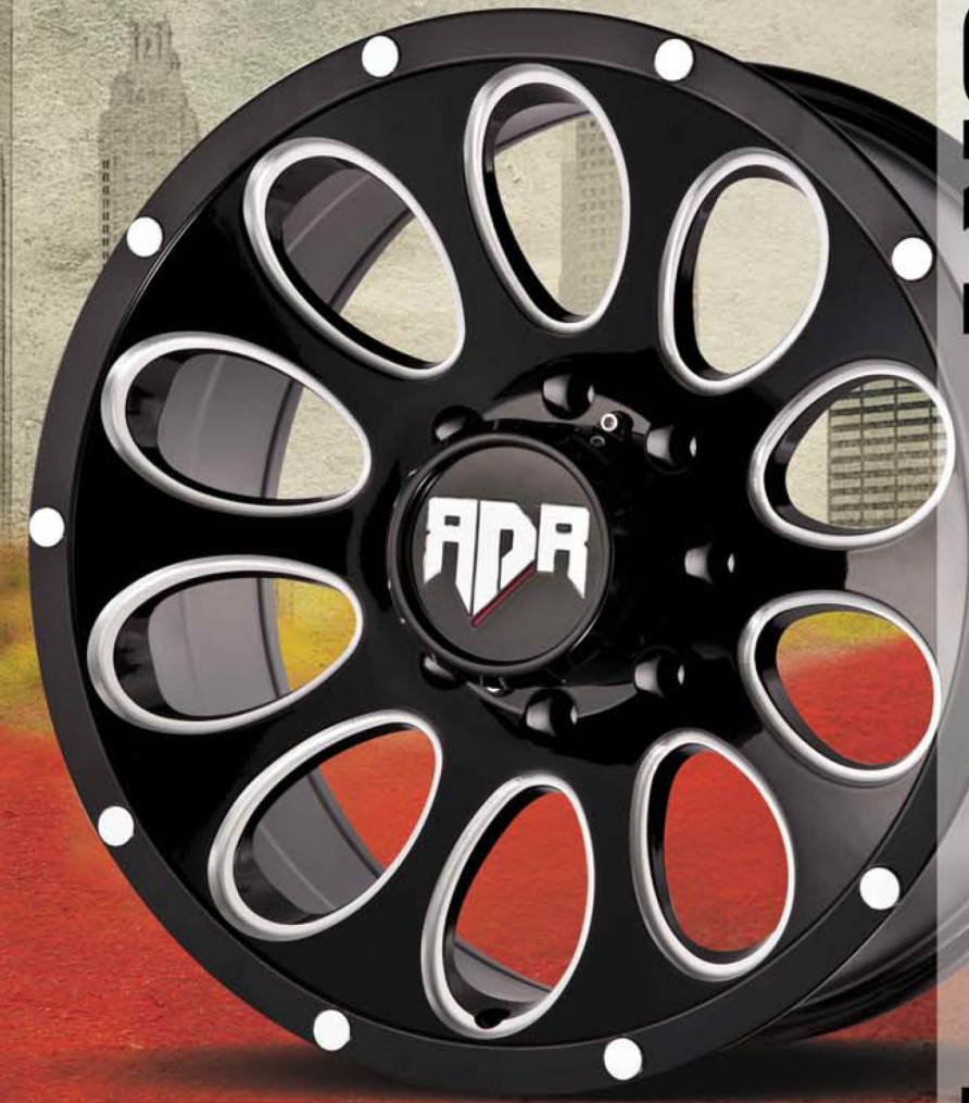
DIRT RD-01 18" 20" 22" Finishes: All Blk, Blk/Machined & Chrome