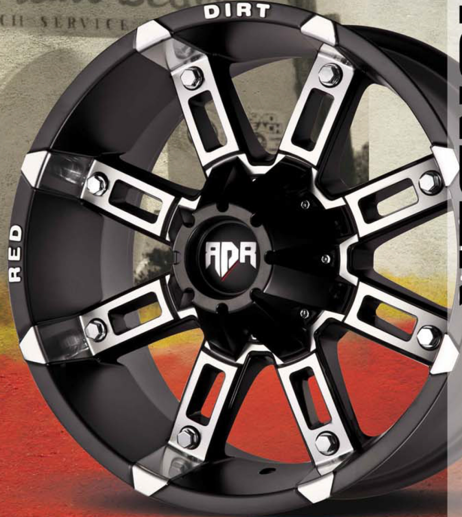
THUNDER RD-06 16" 17" 18" Finishes: All Blk, Blk/Machined & Chrome