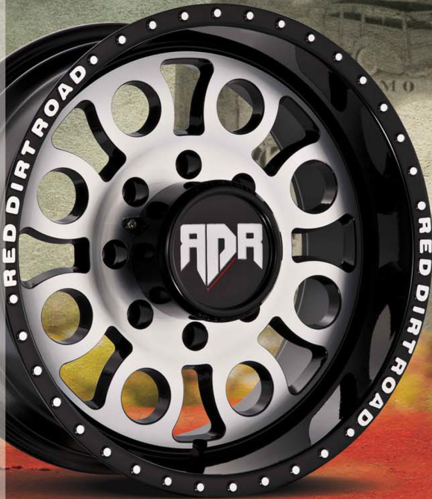
BOSS RD-05 16" 17" 20" Finishes: All Blk, Blk Lip/Machined & Chrome